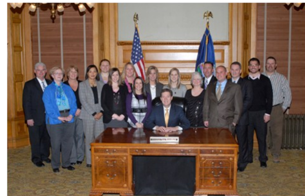
Leadership X Miami County Photo with the Governor Topeka, KS March 2011

Tuition for the Leadership XI Miami County program is $250. Scholarships, based on need, may be awarded to potential leaders for the Leadership XI Miami County class.